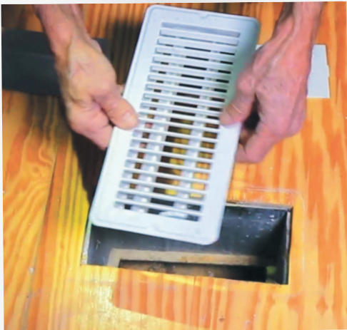
To do: Seal leaky air ducts