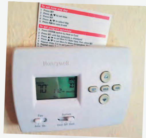
To do: Program the thermostat