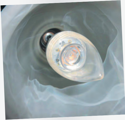
To do: Swap in LED light bulbs