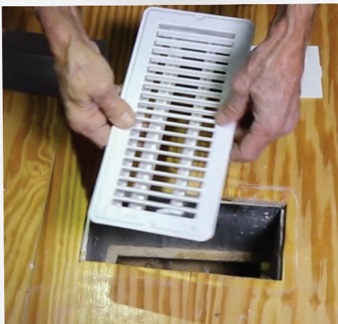
Yuav tau ua: Txhaws tej qhov dlim paa yuav paab koj tseg tau le kws 50% tsws tau them cov paa txag